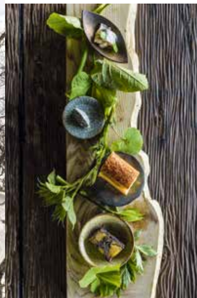
Clockwise from top left: Niseko Village; creative cooking at Shiguchi; hot springs at KAI Poroto; a tranquil lodge at Shiguchi